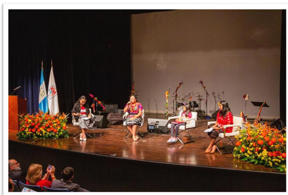
The panel discussion focused on addressing the critical issues, rights awareness, and government role in reducing inequality and safeguarding human rights for indigenous girls in Guatemala.

indigenous girls, adolescents, and young women, advocating for the elimination of discrimination and the promotion of respect for their cultural identities.